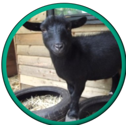
William Intelligent, can get into feed shed when no-one is looking.