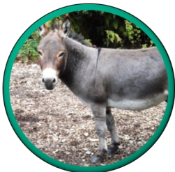
Alfie Mischievous and inquisitive.