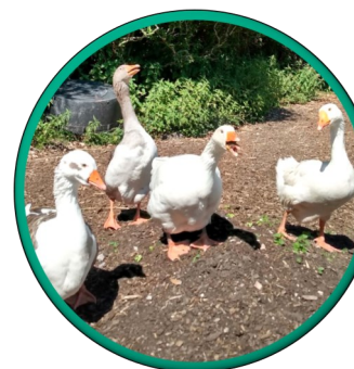
Michael and Demi Our older pair of geese. Geese are faithful and once paired up remain together.