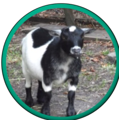
Pippa Enjoys carrots and rubbing on brambles. Gentle, likes cuddles.