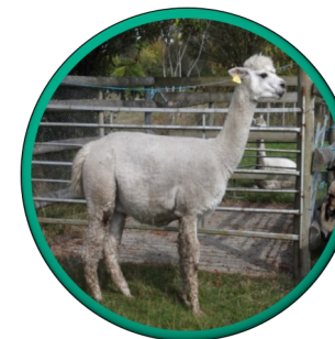
Freddie Lives in the meadow at Furzey Gardens.