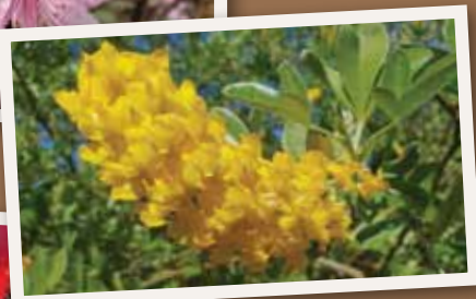
Cytisus battandierii Pineapple broom