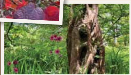
Metasequoia glyptostroboides Dawn redwood