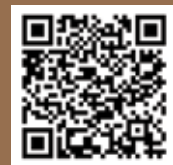
Scan to view plants of interest online.