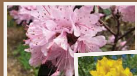
Rhododendron racemosum Rock Rose

Some of the beautiful and rare plants at Furzey Gardens were discovered and brought back from exotic places by the plant hunters of the early 20th century, who risked their lives searching for new specimens across India, China and Tibet. Other plants are more recent additions selected for attractiveness or their unusual story.