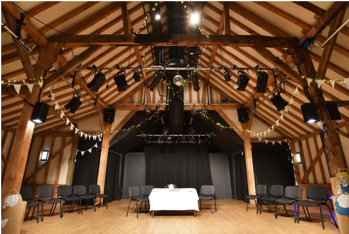
Hanger Farm Meeting / Gallery Space