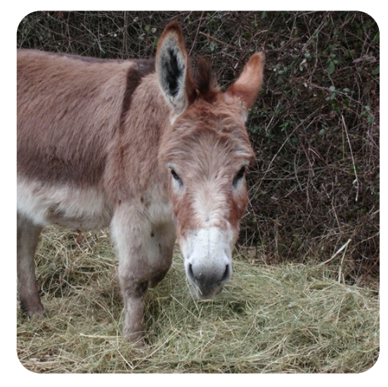
JACK Quiet, sweet natured. Likes his toys.