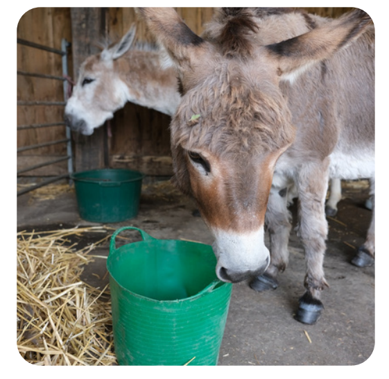
ALFIE Mischievous and inquisitive.