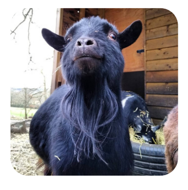
WILLIAM Intelligent, can get into feed shed when no-one is looking.

KATE Enjoys neck rubs. Very friendly and enjoys human company.